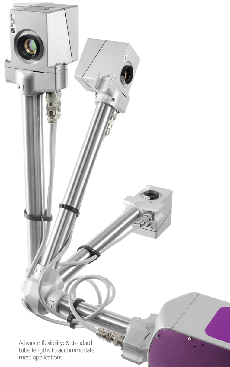
Advance flexibility: 6 standard tube lengths to accommodate most applications

Be assured the BOU was designed to uphold MI's rigorous safety standards and adding the BOU to the marking system will not compromise the factory IP55 protection.